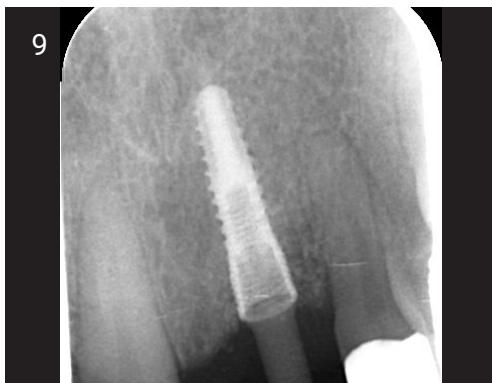
9. Osstell peg, 75 ISQ.