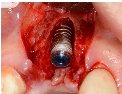
3. Placement of 4.5 by 10 implant.