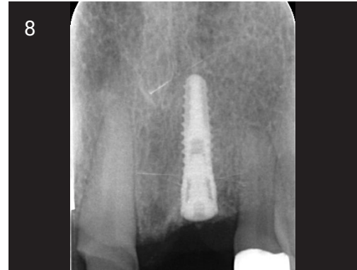
8. Site grafted with EthOss®.