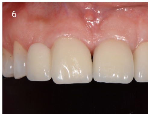
6. Loaded at 9 months.