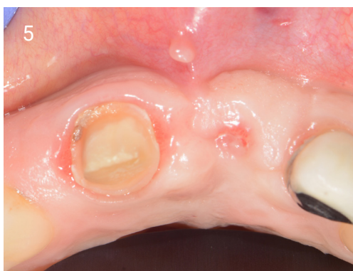
5. Ready to load at 12 weeks.