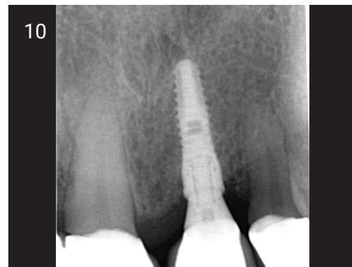
10. Loaded 9 months.