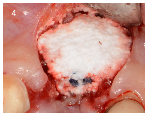
4. Graft with EthOss®.