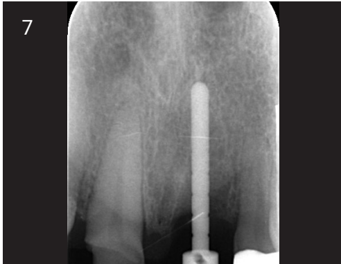
7. Measuring tool to assess height.